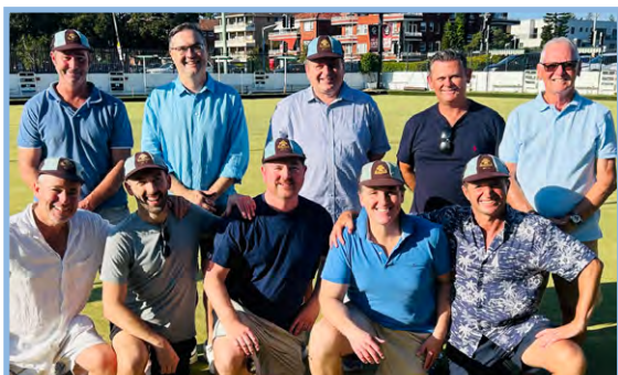
1994 First XI GPS Cricket Premiers 30 Year Reunion