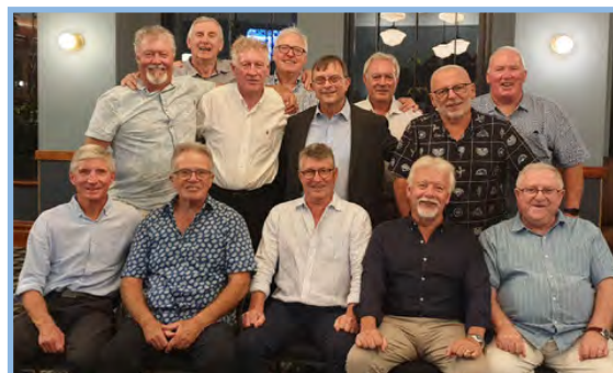
Class of 1972 52 Year Reunion